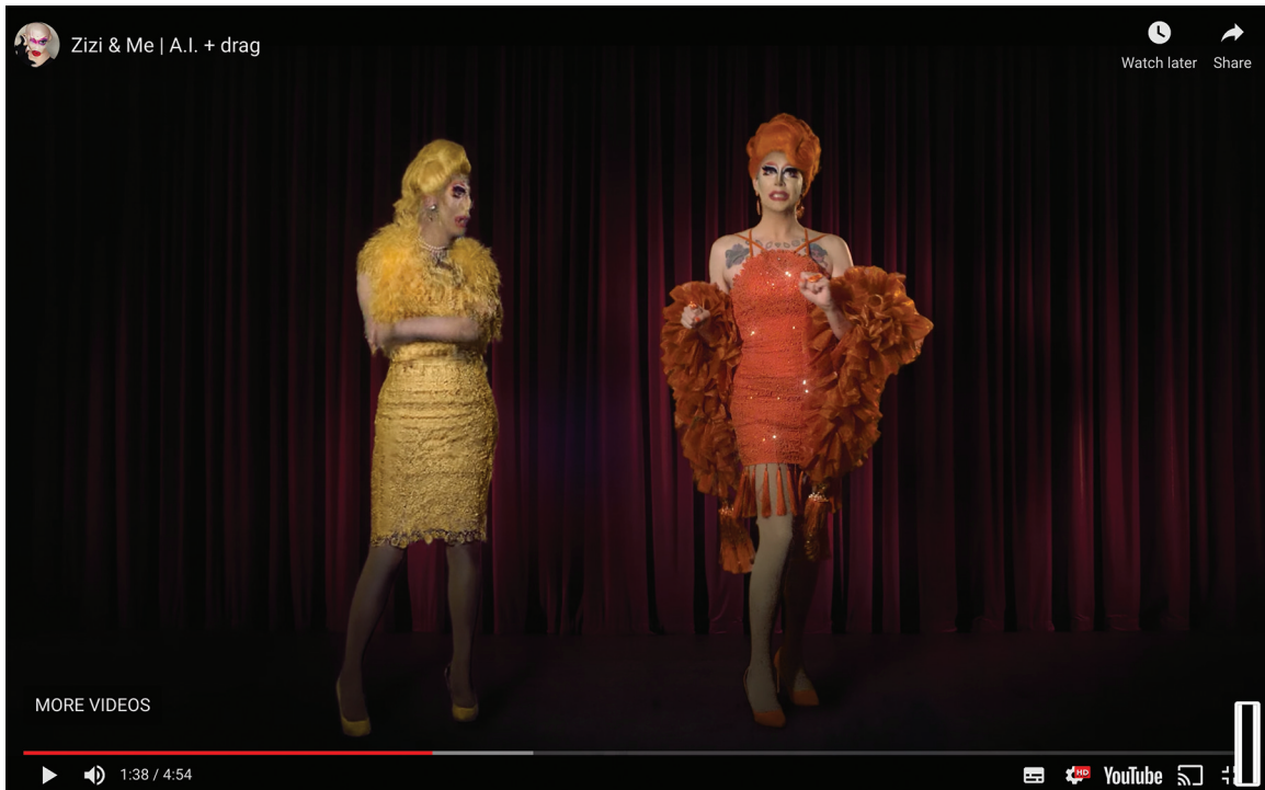
Image 4. Screenshot from Zizi & Me demonstrating a moment where the deepfake fails to accurately replicate Me turning sideways.

In Zizi & Me , Jake created a Machine Learning model of Me by filming her in drag walking around and moving. In this instance, the 'dataset' that was used to create the deepfake was all the filmed footage of Me. Then, from that dataset, they were able to get that machine learning model – or AI version – of Me to do anything. However, with a key tenet of The Zizi Project being concerned with the politics and ethics of engaging with these systems, Jake and Me worked in collaboration to explore what these technologies can be used for in performance rather than exploiting Me's image through the deepfake process. This mode of collaboration with drag is something that extends through the project, but is epitomised in the relationship between Jake and Me, who continue to work closely, both being informed by one another's artistic and political sensibilities.