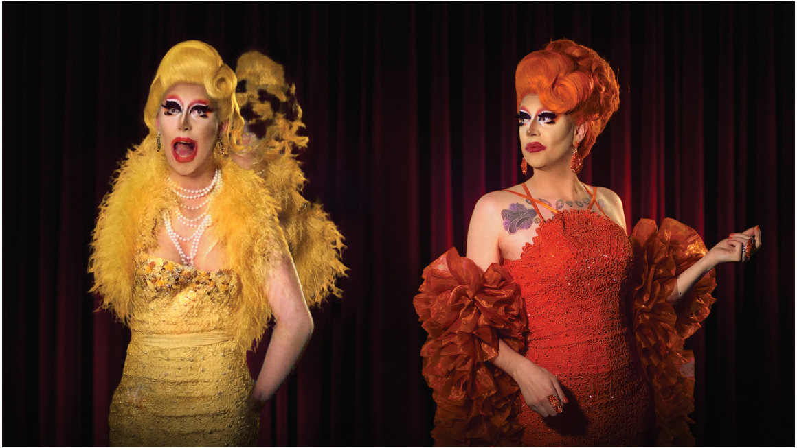
Image 3. Video still from Zizi & Me . Left: Zizi, Right: Me The Drag Queen.

references to specific drag performers and performance forms, there are also these monstrous moments that defy human logics (and, indeed, biology) to speak to the future of drag whilst still being connected to drag histories and presents. Ultimately, whilst body-less, the images created refer back to drag bodies that queered the normative dataset used to generate the work and simultaneously make utopian gestures towards technological and embodied forms which move beyond binarized recognitions of gender and drag forms.