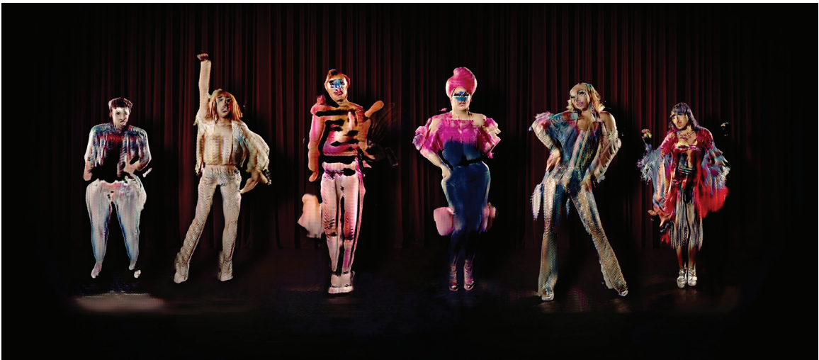
Image 7. Promotional image for The Zizi Show , showing a combination of different drag performers across six deepfake bodies.

the deepfake drag performers. The performers all came from a cross-section of the drag performance scene in London and were chosen as broadly representative of the different identities and performance forms on the scene.