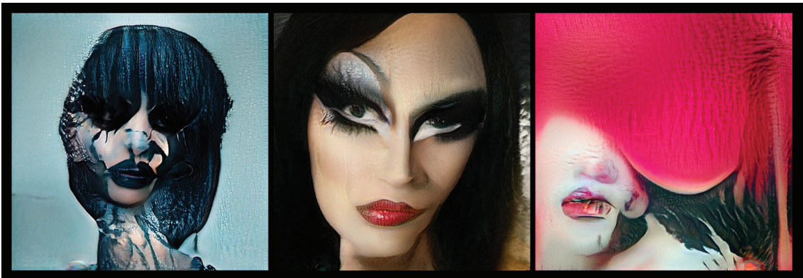
Image 1. 3 different manifestations of Zizi in Queering the Dataset .

AI and Machine Learning surround our existence in both insidious and obvious ways, from voice-activated home assistants including Siri, Alexa, and Google Home to algorithms that determine what content and advertisements we see on social media. AI and Machine Learning systems are able to engage with vast amounts of data at unprecedented speeds. AI systems learn through processes simultaneously similar and different to human learning. One example of these systems, Generative Adversarial Networks (or GANs), can produce deepfakes, where networks generate and manipulate fake imagery of a person almost indistinguishable from reality. 2 Journalist Ian Sample describes deepfakes as '[t]he 21st century's answer to Photoshopping, [they] use a form of artificial intelligence called deep learning to make images of fake events,