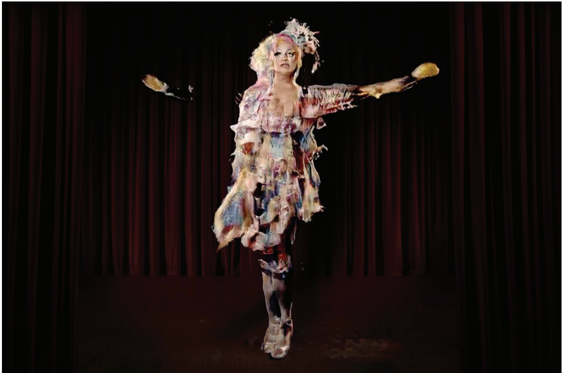
Image 6. Still from The Zizi Show with Zizi performing as an amalgam of all the deepfake drag performers.

It was created using similar processes to Zizi & Me , with thirteen performers being filmed walking around to create the datasets for new deepfake drag acts. Of those, five performers then created lip sync performances which were filmed to be used as the movement to control